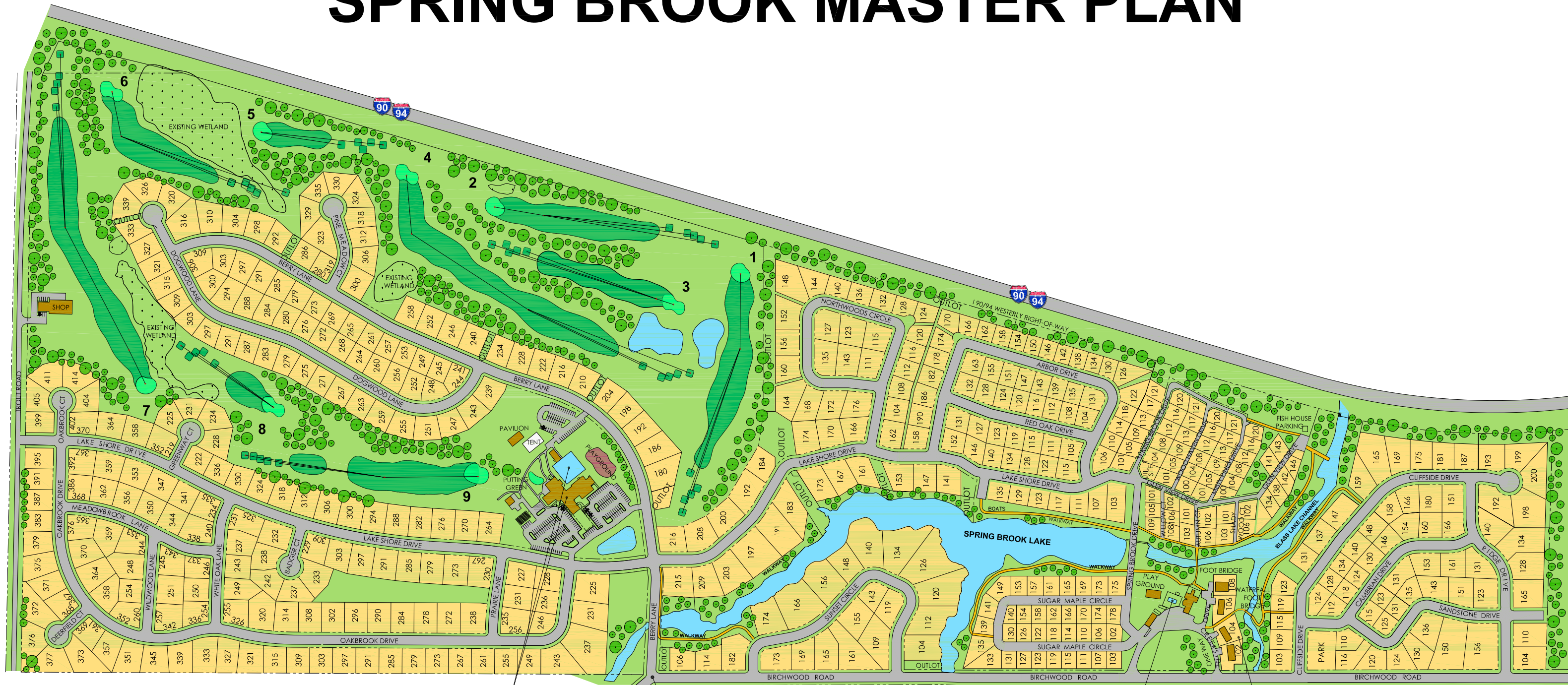
GOLF COURSE SCORECARD